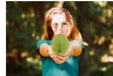
Horizontal: Climate, environment, economics/CBA, state aid, innovation, risk management...