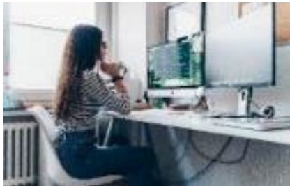
RDI and ICT & Broadband