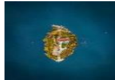
Water and waste water