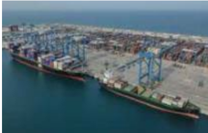
Ports / Airports