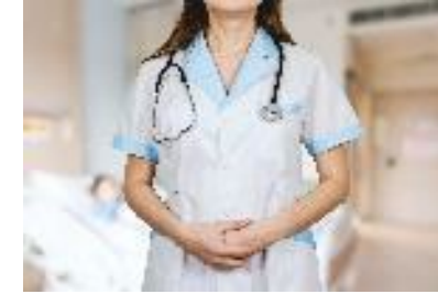
Health and education