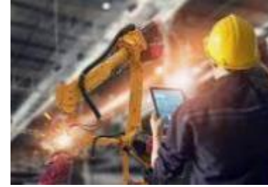
Innovative industries & transformation