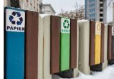
Circular economy and solid waste